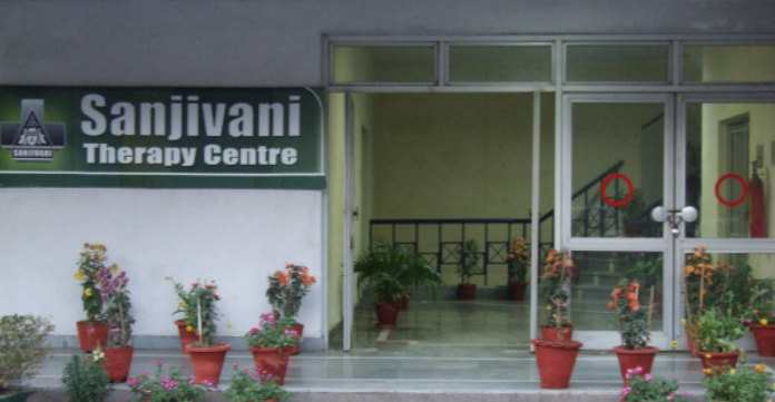
The facade of Sanjivani Therapy Centre at its Siri Fort Sports Complex, Institutional Area